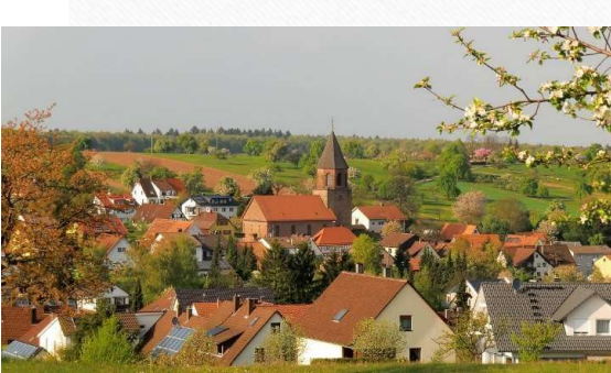
Over the Hills of Völkersbach